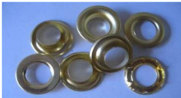
Tent & shoe buckle . 1100 aluminum strip 0.27-0.32 mm.