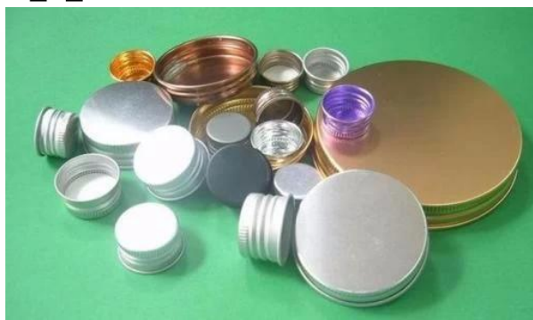
Wine & Pharmaceutical Caps. 8011 H 14/H 16 aluminum strip 0.2-0.25 mm.