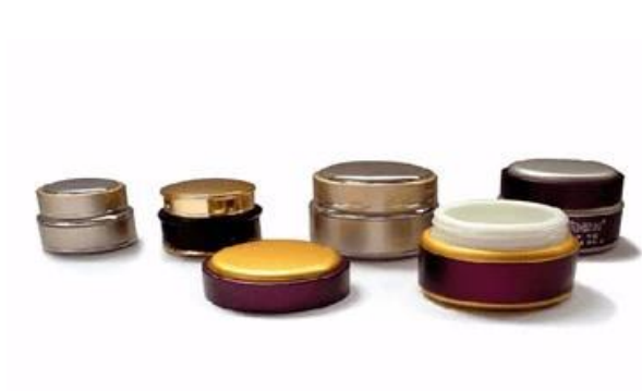
Cosmetics caps. 1060 H 24 aluminum strip 0.5 mm.