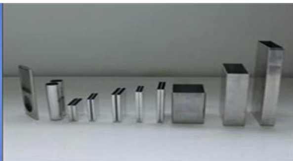
Battery case. 3003 O aluminum strip 1.0-2.0mm. 3003 H 14/H 16 aluminum strip 1.0-2.0 mm.

Deep stamping Aluminum strip is widely used in cosmetic cover, deep drawing aluminium wine cover, a medicine cover, tent buckle, shoe buckle, mobile phone and battery shell. Aluminum is required for good ductility and for deep drawing.